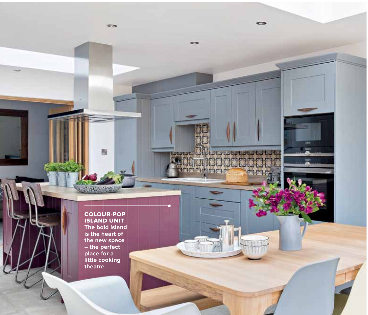
COLOUR-POP ISLAND UNIT The bold island is the heart of the new space – the perfect place for a little cooking theatre

Ottoman tiles, £250 per sq m, Original Style range, Rovic Tiles. Built-in oven, £639; built-in microwave, £599; both Siemens range, John Lewis. Grey oak matt worktop, £150 per m, Wren Kitchens